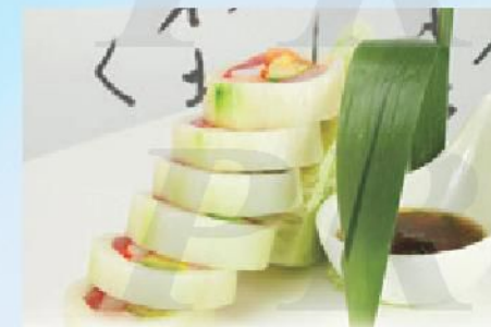
R17. Naruto Roll 12.95 Tuna, salmon, yellowtail, crabmeat, avocado, tobiko wrapped in cucumber with puzu sauce