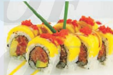
R19. Mango Roll 11.95 Crunch, spicy tuna, avocado with mango on top