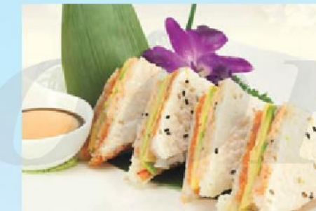
R15. Sakura Sandwich 13.95 Spicy tuna, crabmeat, lobster salad, avocado and shrimp, crunch, tamago w. chef special sauce.