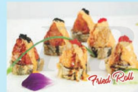
R14. Volcano Roll 13.95 Deep fried pineapple roll w. half spicy tuna and half spicy lobster, shrimp, crab, and tobiko eel sauce on top