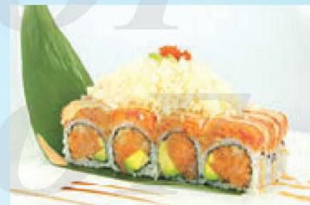
R16. Spicy Girl Roll 12.95 Crunch, spicy salmon, spicy yellowtail, avocado inside, top with crunch spicy tuna, tobiko, scallion.