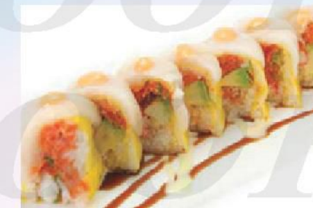
R18. Tuna Tori Roll 12.95 Spicy tuna and avocado inside, wrap soybean paper fresh tuna, white tuna with honey wasabi spicy mayo on top