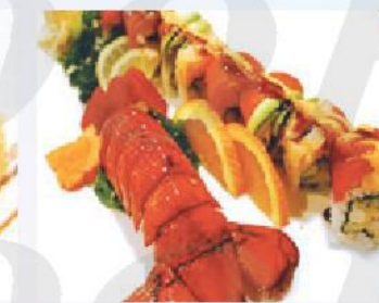
R25. Lobster Rainbow 14.95 Lobster tempura, cucumber top with fresh salmon and tuna, chef special sauce.

Consuming raw or under cooked meats, poultry, seafood, shellfish or eggs may increase the risk of food-borne illness.