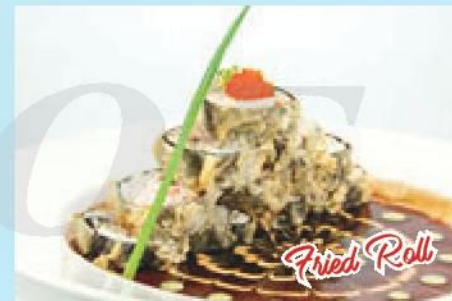
R13. Shippensburg Roll 13.95 Eel, shrimp, crabmeat, white fish and salmon deep fried w. chef special sauce.