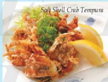
Soft Shell Crab Tempura