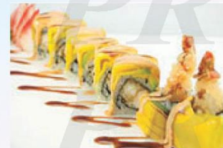
R20. Tokyo Roll 12.95 Shrimp tempura inside top with mango, avocado in eel sauce and spicy mayo sauce