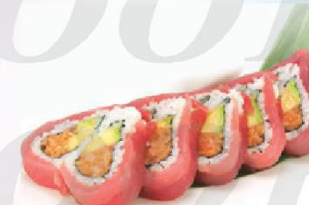
R21. Love Roll 12.95 Spicy tuna, spicy yellowtail, spicy salmon avocado, and crunch top with fresh tuna