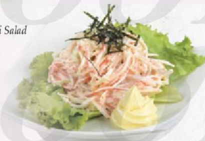
Spicy Kani Salad